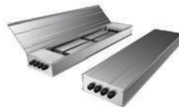
Remote IP65 Enclosure