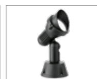
Spike Light Shown With Mounting Base