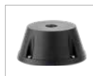
Spike Light Mounting Base