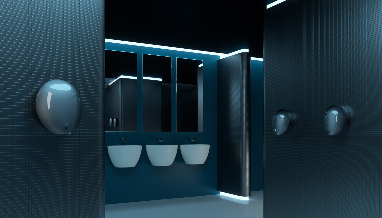
Pebble Mini Silver